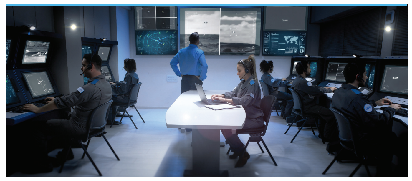
Sky Spotter control Center

Sky Spotter uses highly sensitive MWIR, SWIR and Day sensors, establishing a passive aerial surveillance over tens of kilometers. Advanced algorithms of automation, image processing and Artificial Intelligence (AI), enable multiple targets to be detected , tracked and managed simultaneously.