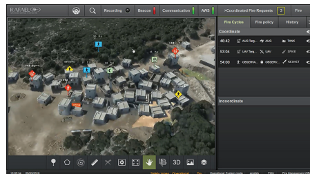
Fire Management Terminal